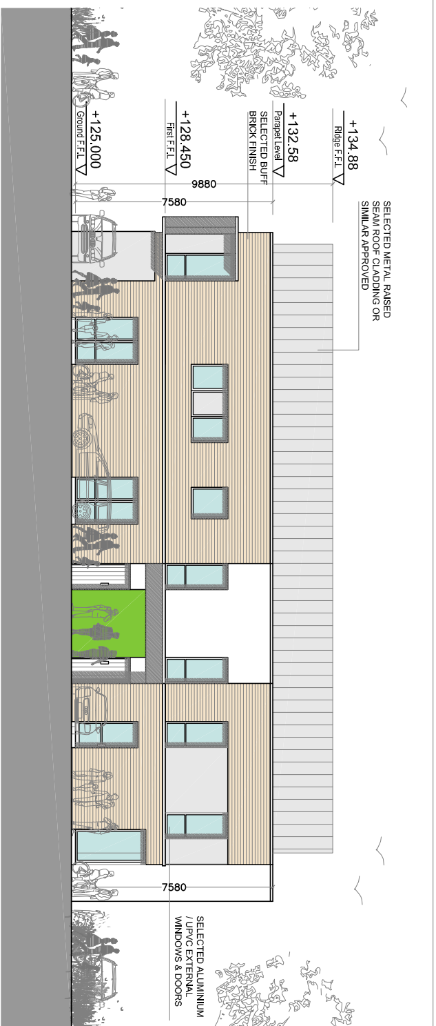
Eastern Elevation SCALE 1:200 @ A3