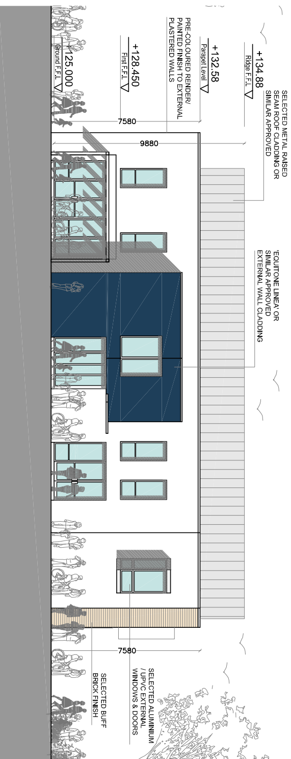
Western Elevation SCALE 1:200 @ A3