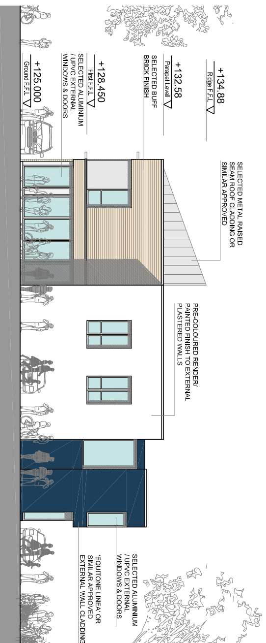
Northern Elevation SCALE 1:200 @ A3