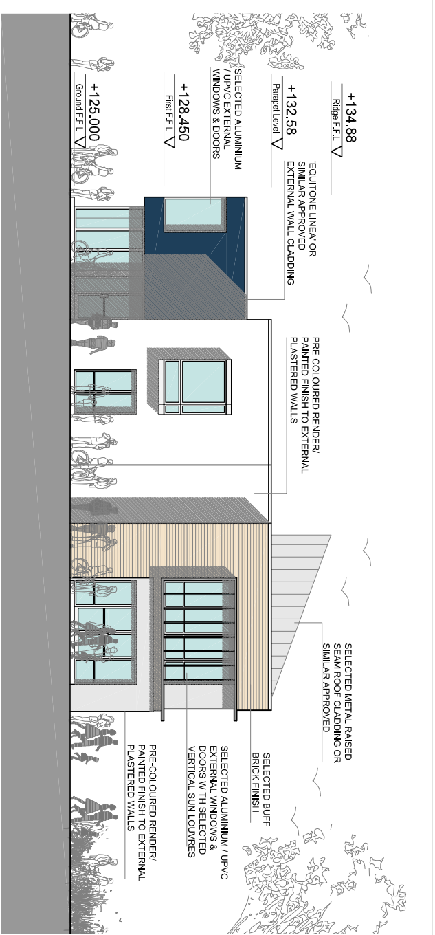
Southern Elevation SCALE 1:200 @ A3